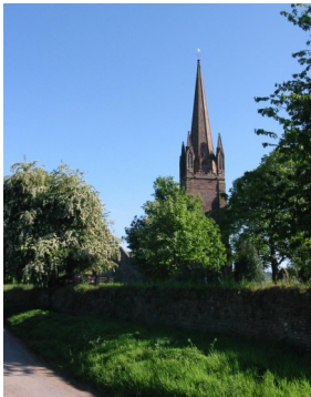
The spire of Weobley Church is the second tallest in Herefordshire

Weobley's origins date back before Norman times. Its name was derived from "Wibba" the Anglo Saxon son of Creda and "ley" meaning a clearing or glade in a wood. The trail is in two parts, the inner and outer; the latter (see green circles below) includes the Church. (allow 40mins.) The inner trail (see yellow circles) is in and around the village centre. (allow 30mins.) At each stopping point on the trails is a plaque with information about the place you are looking at. Each plaque is numbered and directions are given to the location of the next plaque. There are plenty of places to stop and rest and take refreshments.