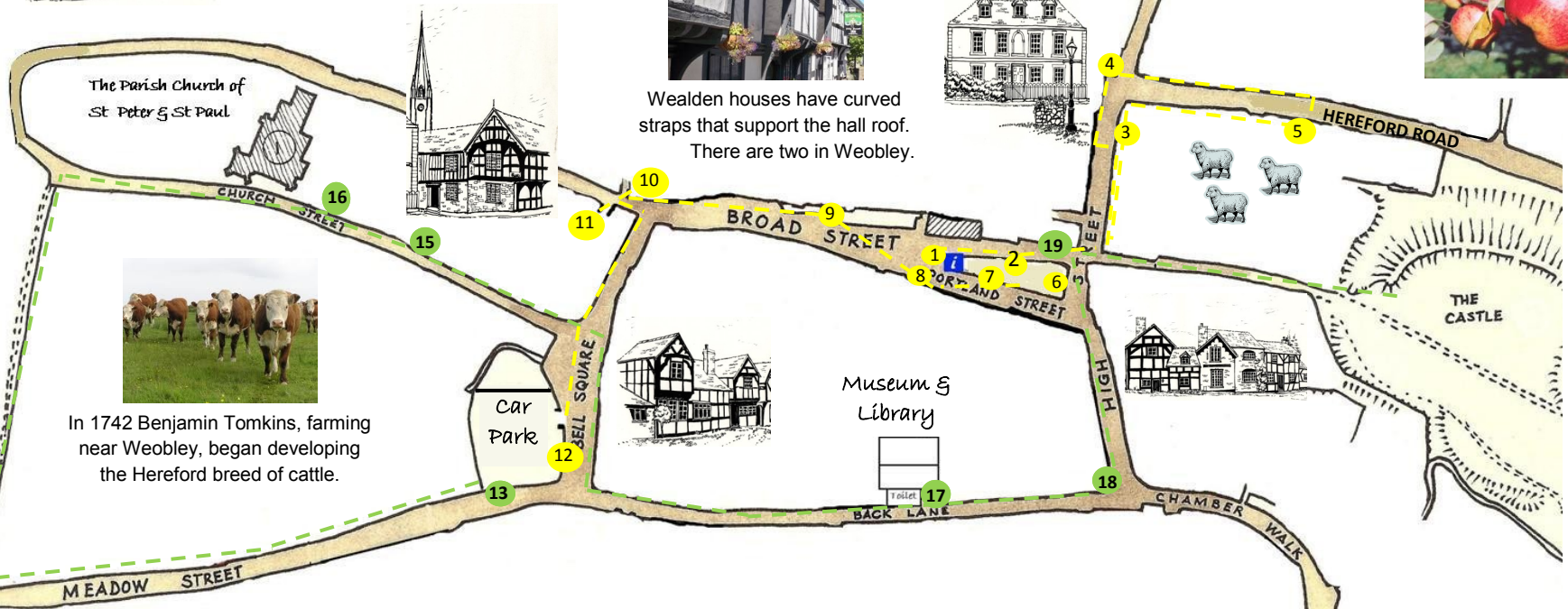
In 1742 Benjamin Tomkins, farming near Weobley, began developing the Hereford breed of cattle.

All the timber framed houses in Weobley are constructed of wood frames of recently felled oak, cut to size off site. A number was scratched into the timber at each joint position so a house could be assembled like a kit. As the oak dried, the joints tightened, making them stronger. (As you walk around the village look for the wooden pins which hold the joints together.)