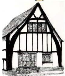
A fine example of a cruck frame. One of two in the village

The hall was used for transacting business, receiving visitors and eating. Often servants would sleep on sacks, filled with hay, on the rush-strewn floor beside the fire. Hence the expression 'hitting the sack'. Some people added fragrant bedstraw ( Gallium Verum ) to the sacks which had the added advantage of being a natural flea killer. At night the fire was covered for safety, in French cuevrefeu , giving us the English word, curfew .