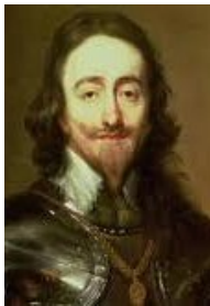
Charles 1st stayed in Weobley in 1645 during the Civil War