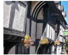
Wealden houses have curved straps that support the hall roof. There are two in Weobley.